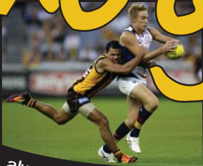
always wash your hands